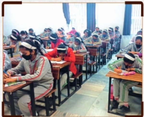
Registered students participating in the Olympiad

Throughout these stages, the West Bengal Heritage Olympiad is thoughtfully designed to progressively challenge students at each level. By combining objective assessments, creative expressions, written analyses, and oral presentations, the Olympiad provides a holistic evaluation of students' heritage awareness and intellectual capabilities. This comprehensive approach ensures that the most knowledgeable and articulate students are recognized and rewarded, fostering a deeper connection with and appreciation for West Bengal's cultural heritage among the youth.