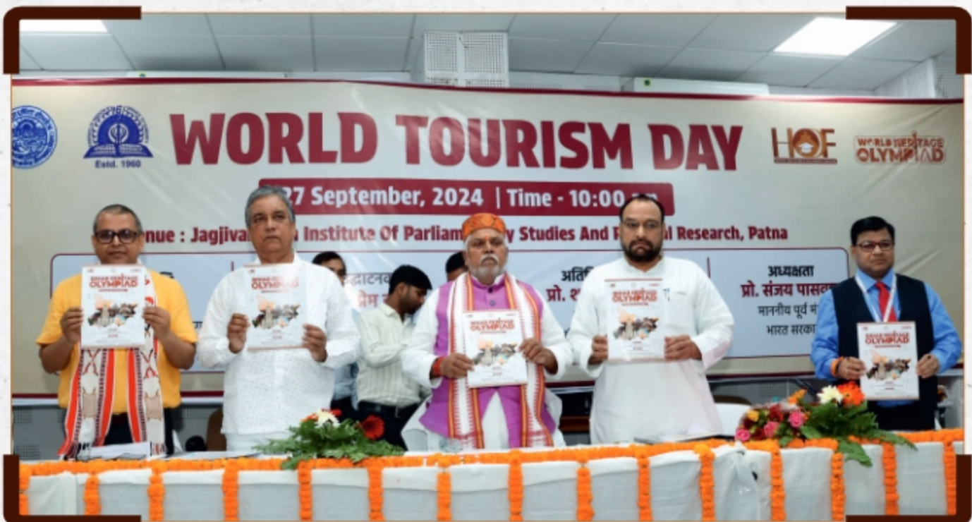
Dr. Prem Kumar, Hon'ble Minister, Environment, Forest & Climate Change, Government of Bihar and other dignitaries releasing the poster of the Olympiad.

Registration Process : The registration process for the Olympiad 2024 has been officially commenced from 27 September 2024. Schools and individual students is registering through both online and offline portals specifically designed to streamline the enrolment process. The portal will provide detailed guidelines on eligibility criteria, competition stages, and important dates. Additionally, the organizing committee will offer assistance to ensure a smooth and inclusive registration process, accommodating participants from diverse backgrounds.