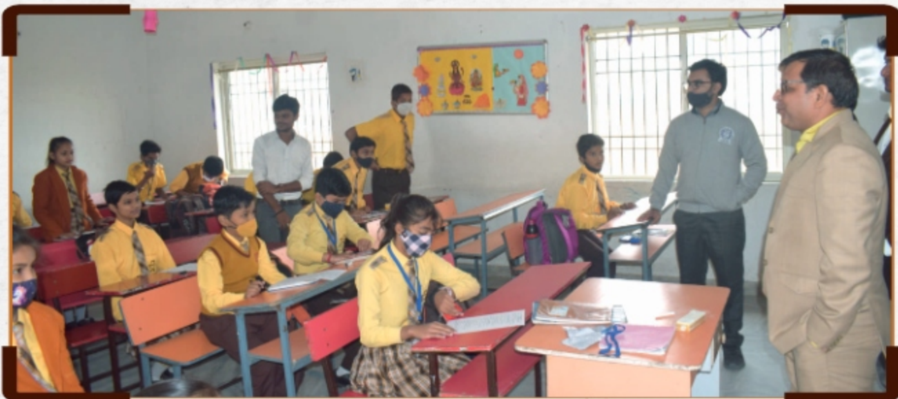
Participation of the students of the selected school in the Olympiad.

Throughout these stages, the West Bengal Heritage Olympiad aims to test students' knowledge and inspire them to explore and appreciate the historical and cultural richness of their state. The structured progression from school to district to state level ensures that the competition is fair and inclusive, while also providing a platform for students to achieve recognition and reward for their intellectual efforts.