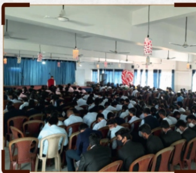
Glimpses of participation of the registered students of the selected schools during the pilot project.